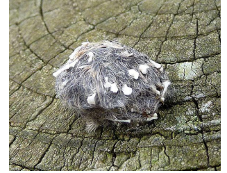
A grayish pellet on the ground under a tree