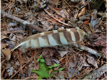
A single feather