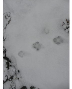
Footprints that are dog-like.