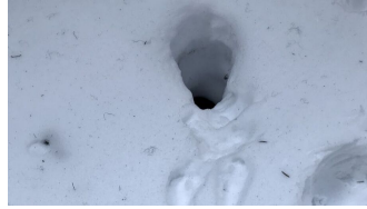
Hole where animal dug for a mouse