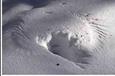
Wing prints around a hole in the snow