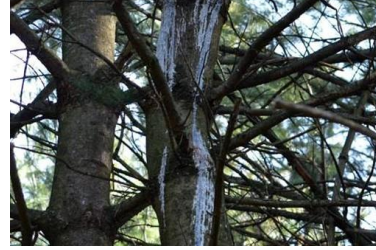
White scat on a tree trunk