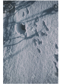
Tiny hole with tiny tracks leading to it.